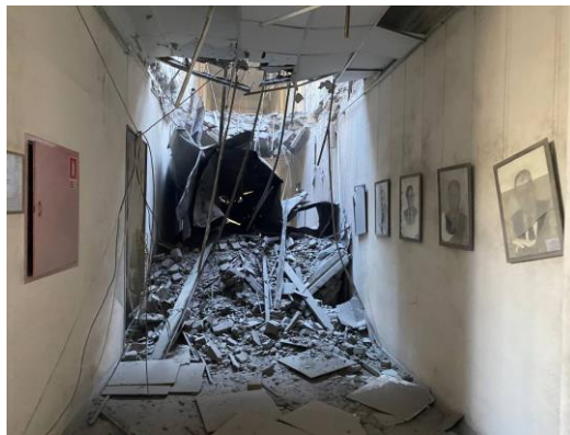
Nikopol, Dnipropetrovsk region