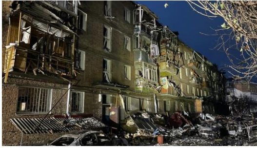
Vyshhorod, Kyiv region, 23.11