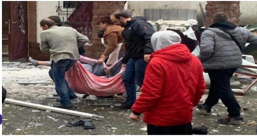
Dnipro region, Nikopol district