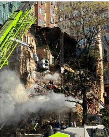
Kamikaze drone attack in Kyiv