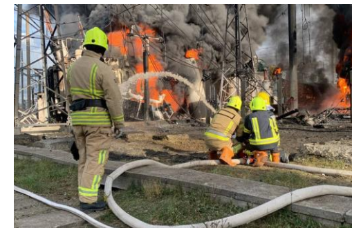
Consequences of attack on power infrastructure in Rivne (left) and Zhytomyr (right)